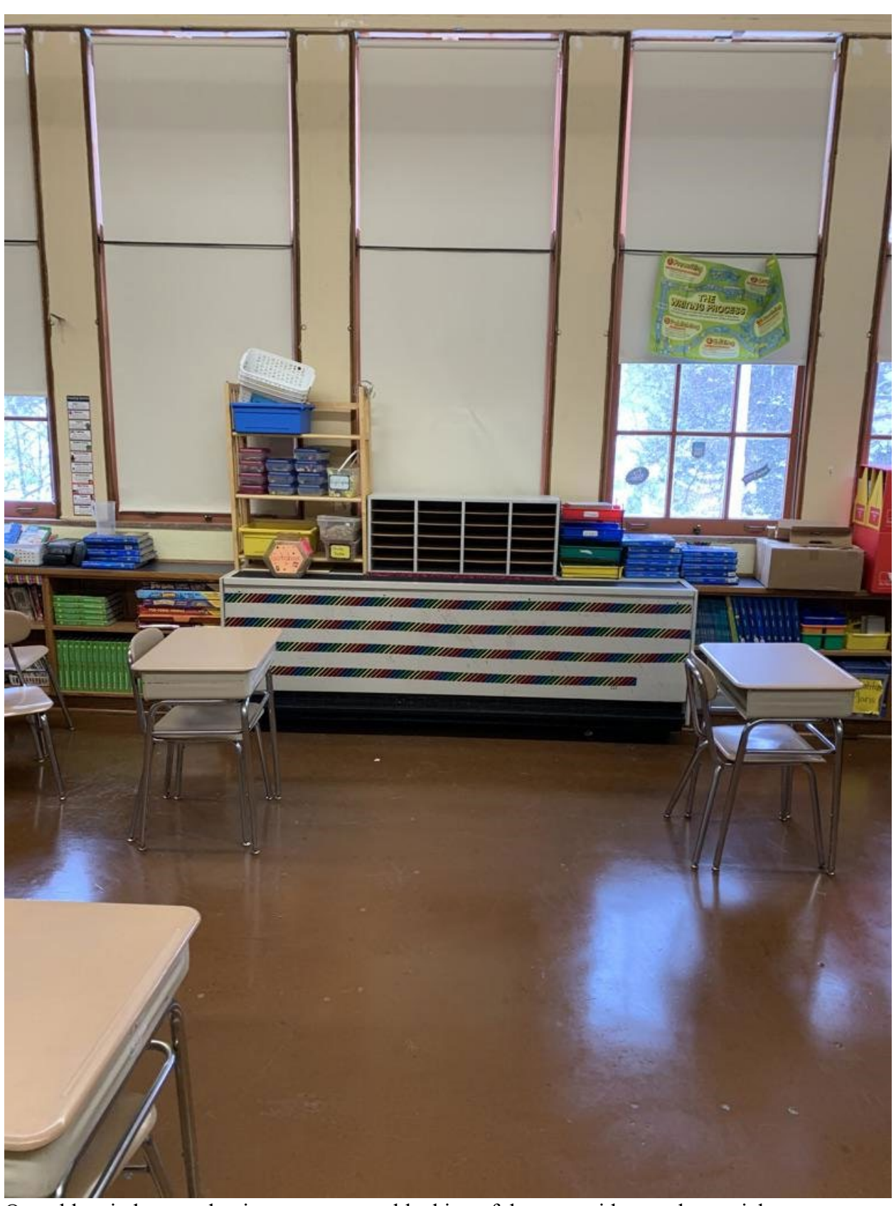
Operable windows and univents – prevent blocking of the vent with stored materials