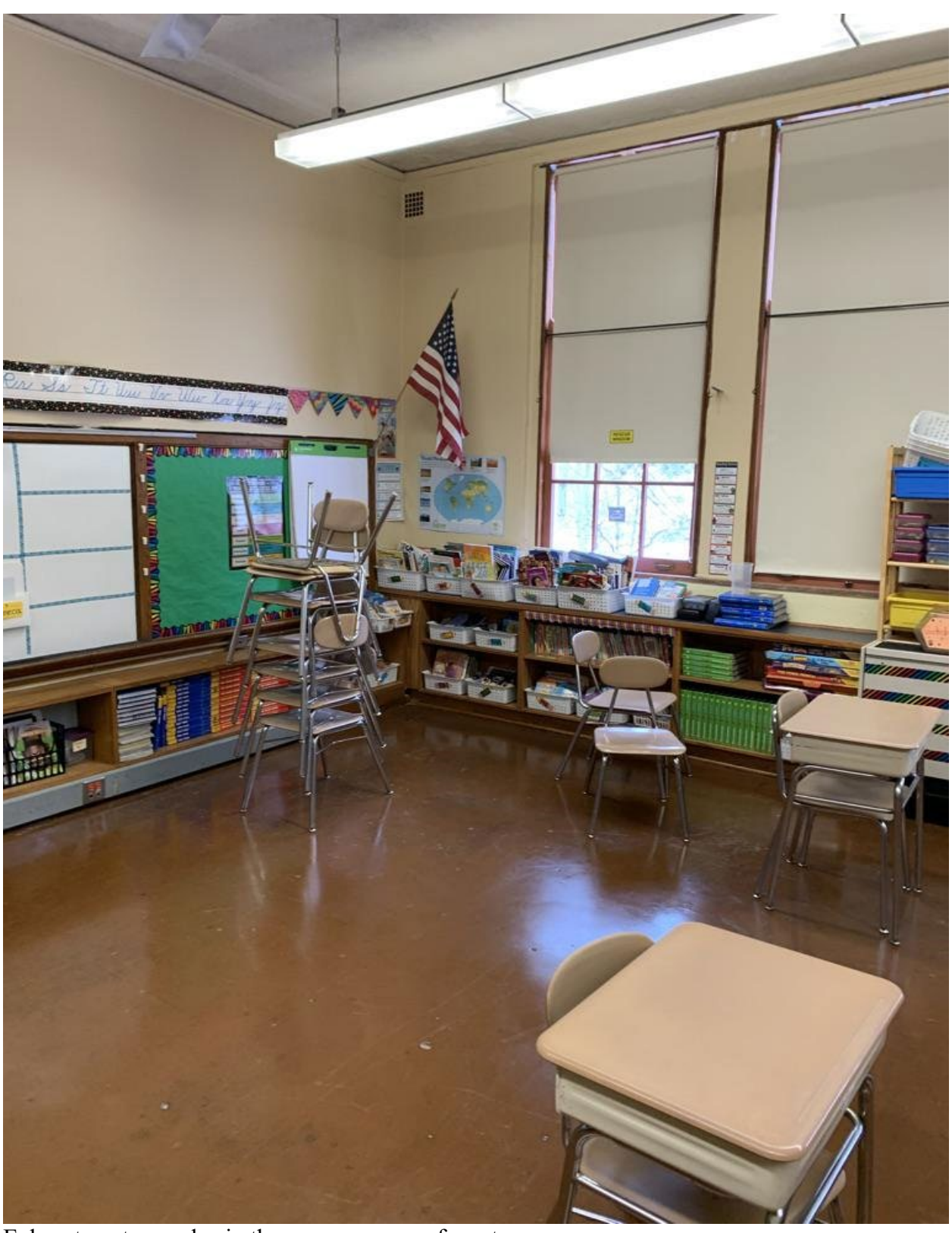
Exhaust vents are also in the upper corners of most rooms