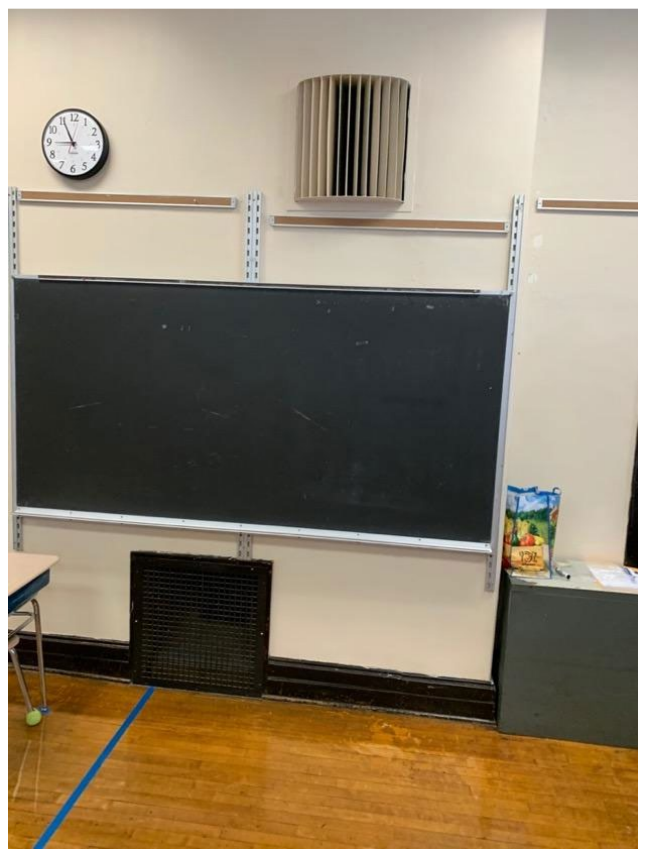
Supply vent in a classroom at ceiling and exhaust at floor