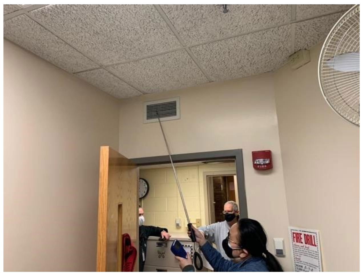
Supply vents provide ventilation air from the blowers