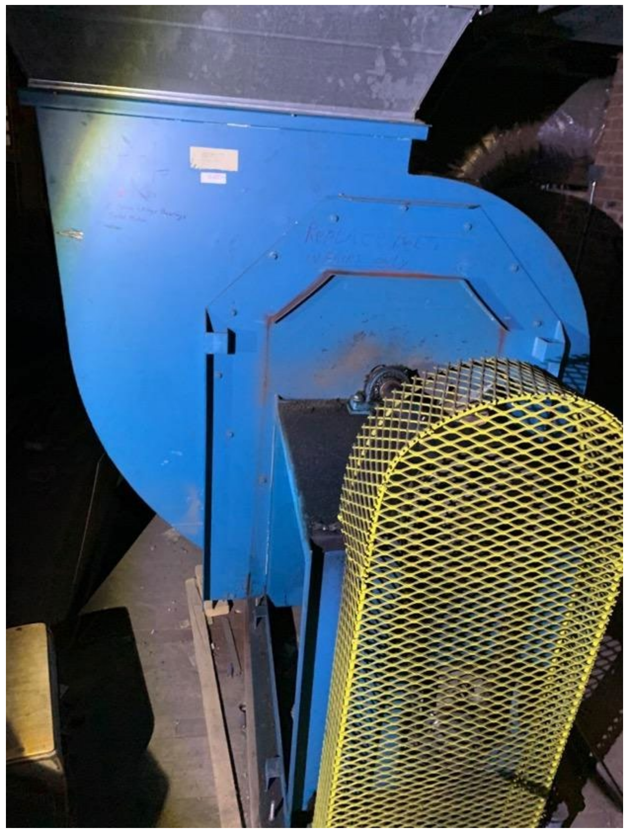
Exhaust fan is running