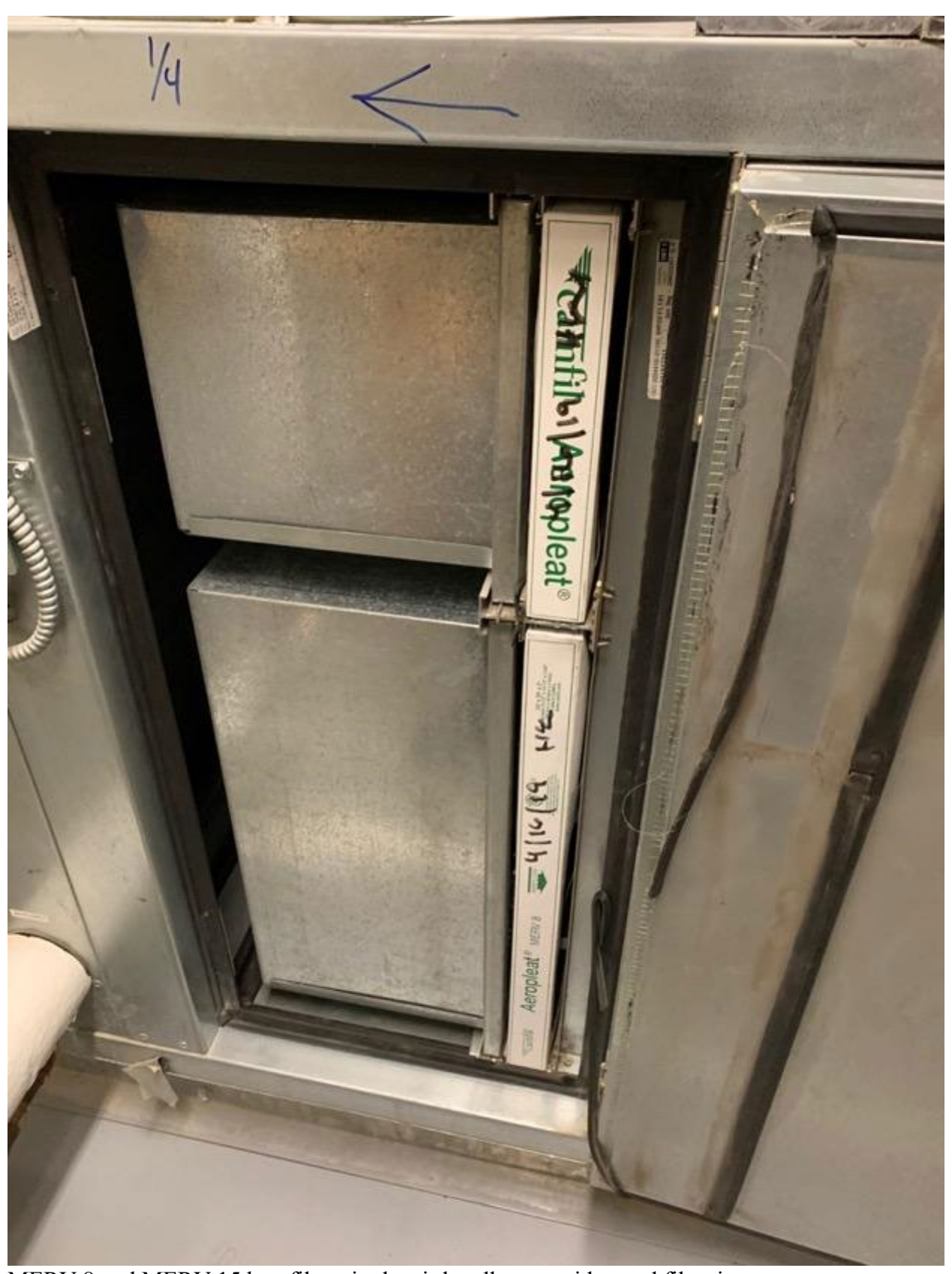
MERV 8 and MERV 15 box filters in the air handlers provide good filtration