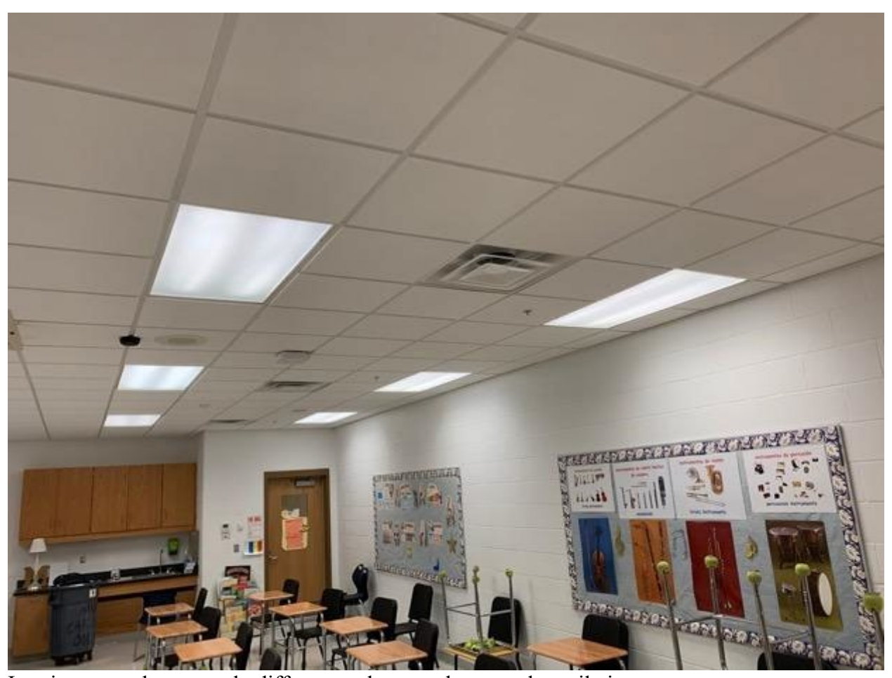
Interior rooms have supply diffusers and are on the central ventilation