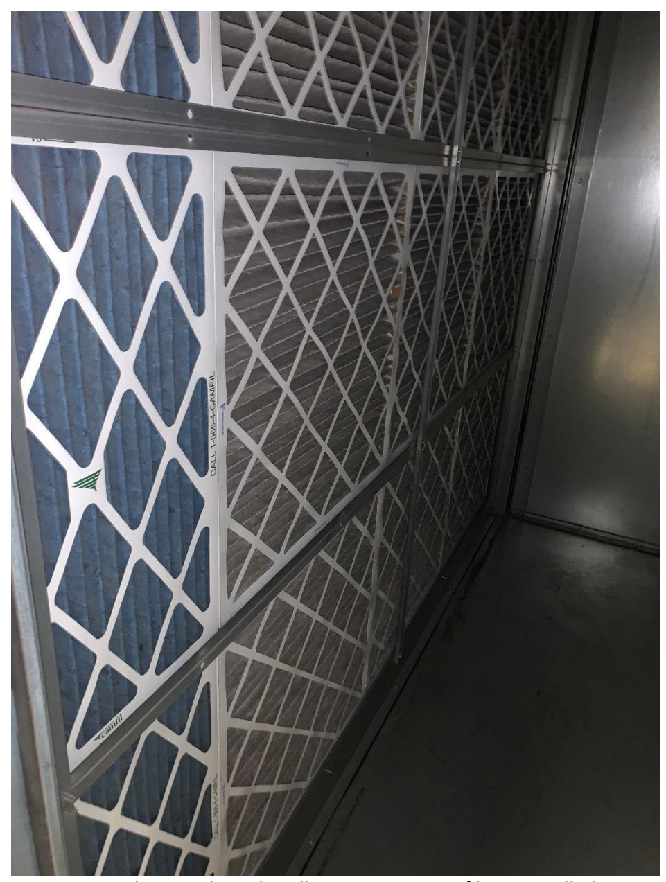
Mixing box inside air handler units. MERV 8 filters installed.