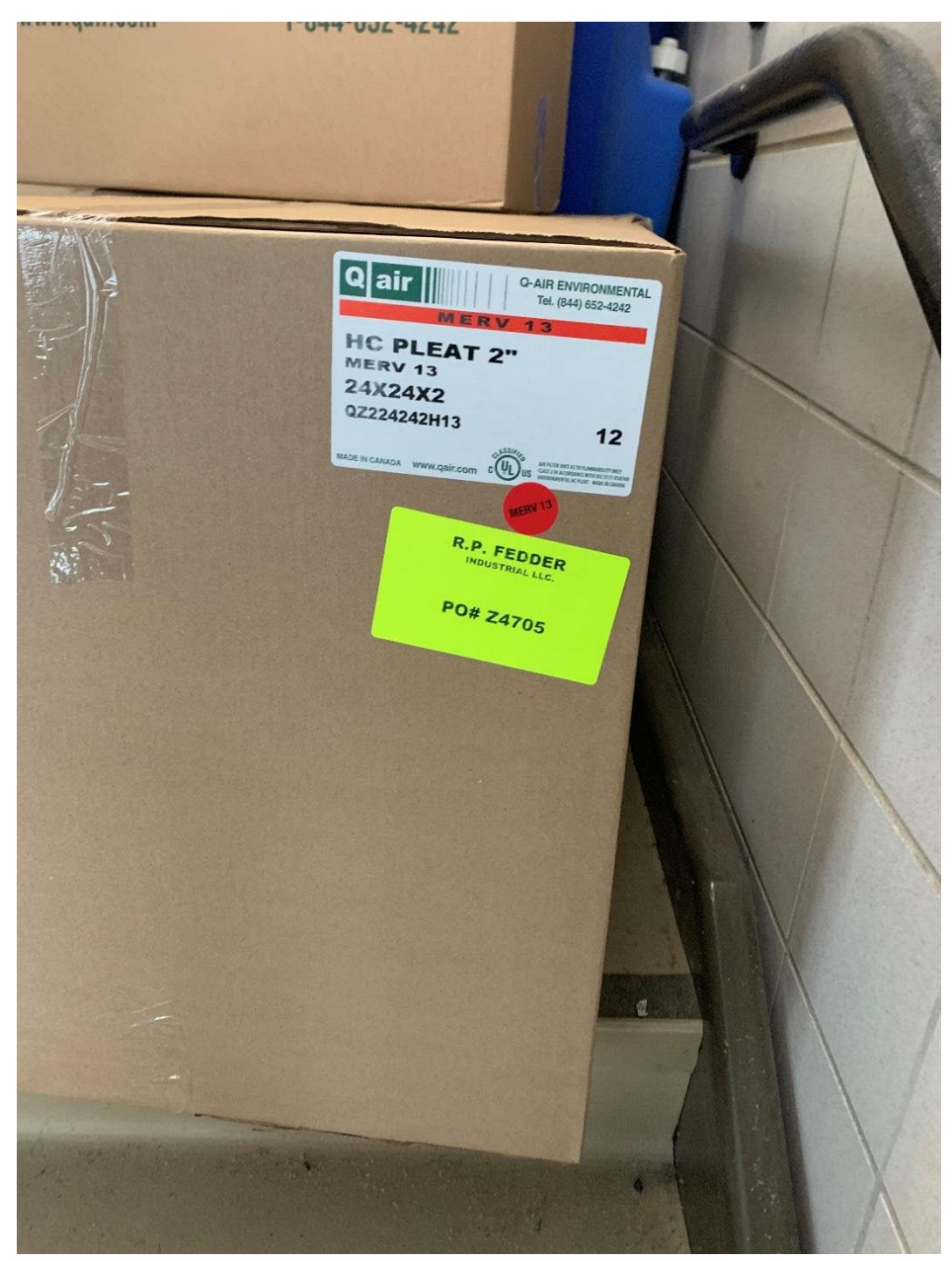
MERV 13 filters shipment at the school. To be installed.