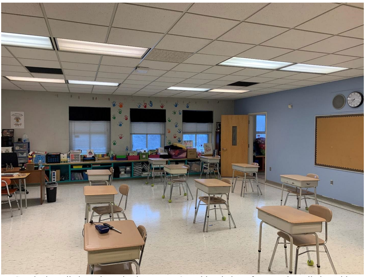
Standard ventilation scheme in classrooms. Operable windows for natural ventilation with mechanical ventilation supply located around the light fixtures and passive return into the ceiling.