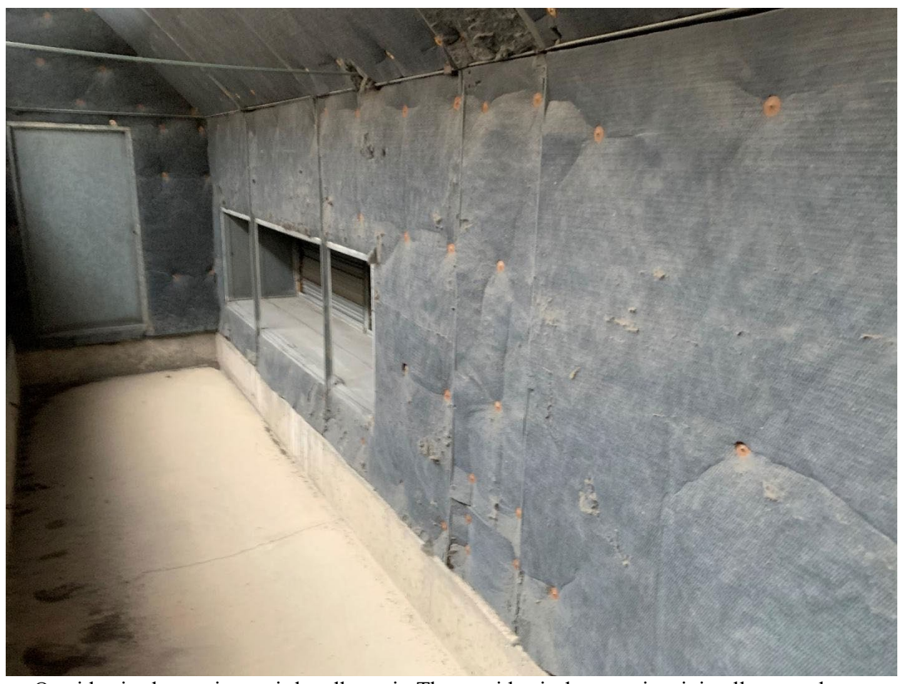
Outside air plenum in an air handler unit. The outside air dampers is minimally open due to temperature constraints.