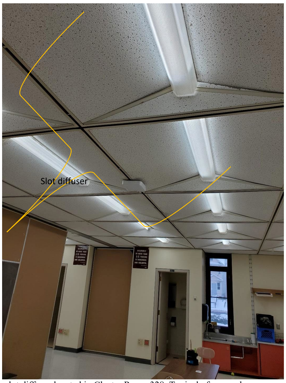
Linear slot diffuser located in Cluster Room 328. Typical of many classrooms visited.