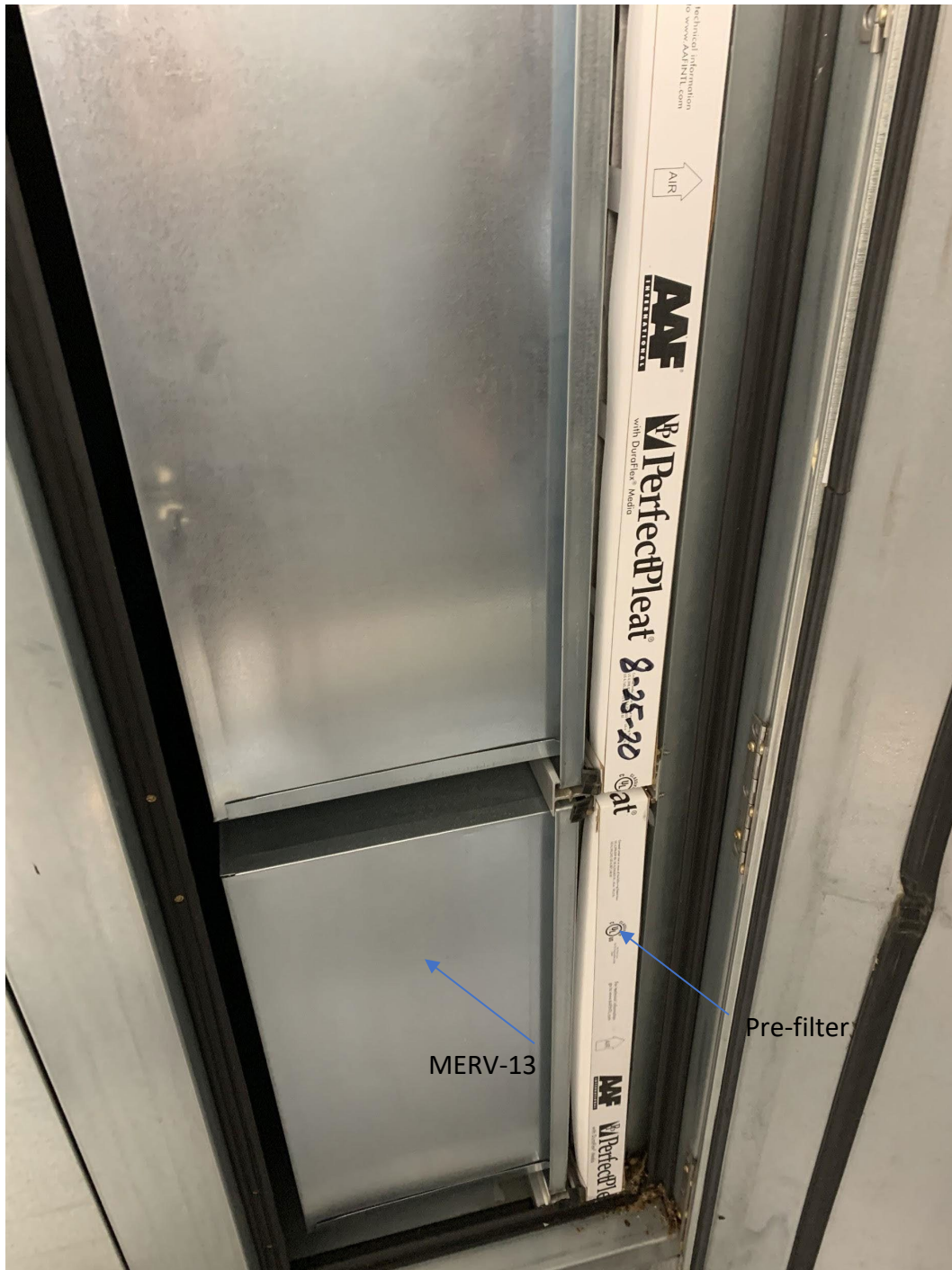
MERV 8 pre-filters with MERV 13 box filter in air handler unit