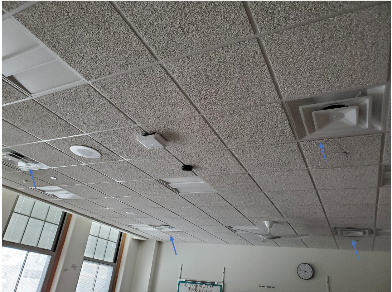
Typical ventilation supply diffuser in classrooms located on the ceiling