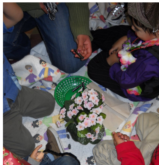
Preparing to mark a teeka on the forehead

Common Core: Domain 5, Social Studies—Geography 1. Develops a basic awareness of self as an individual, self within the context of family, and self within the context of community. a, g. 2. Demonstrates awareness and appreciation of their own culture and other cultures. b, d.