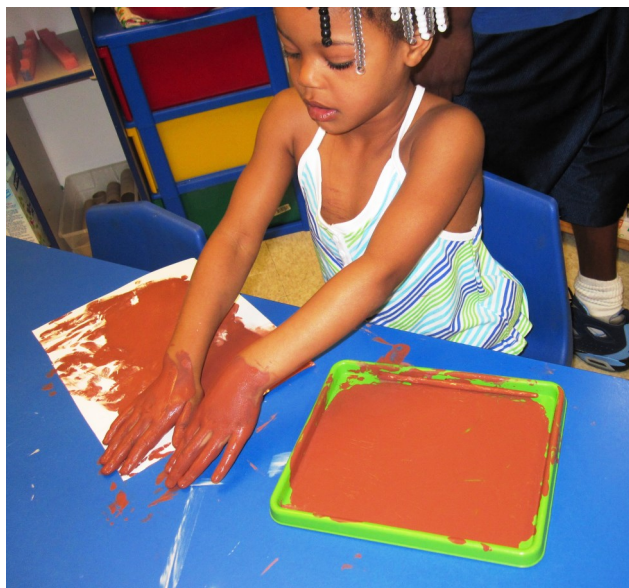
"Discovering Shades of Color"