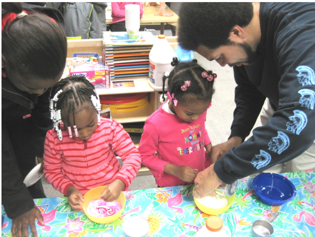
Children and parents experience the transformation, mixing the glue and liquid starch to make silly putty. Adding color makes it even better!

Are your hands really clean after you wash them? Children were able to find out using a special black light to see if germs were left behind on their hands. This showed children how important it is to wash between fingers too.