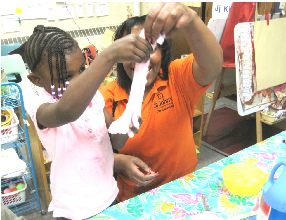
Playing with the silly putty is even more fun than making it. What a wonderful sensory experience!

Science can be messy too as families explored mixing glue and liquid starch to make silly putty. Color mixing is an activity that children are very familiar with; they were able to show parents what colors they needed to mix to make secondary colors.