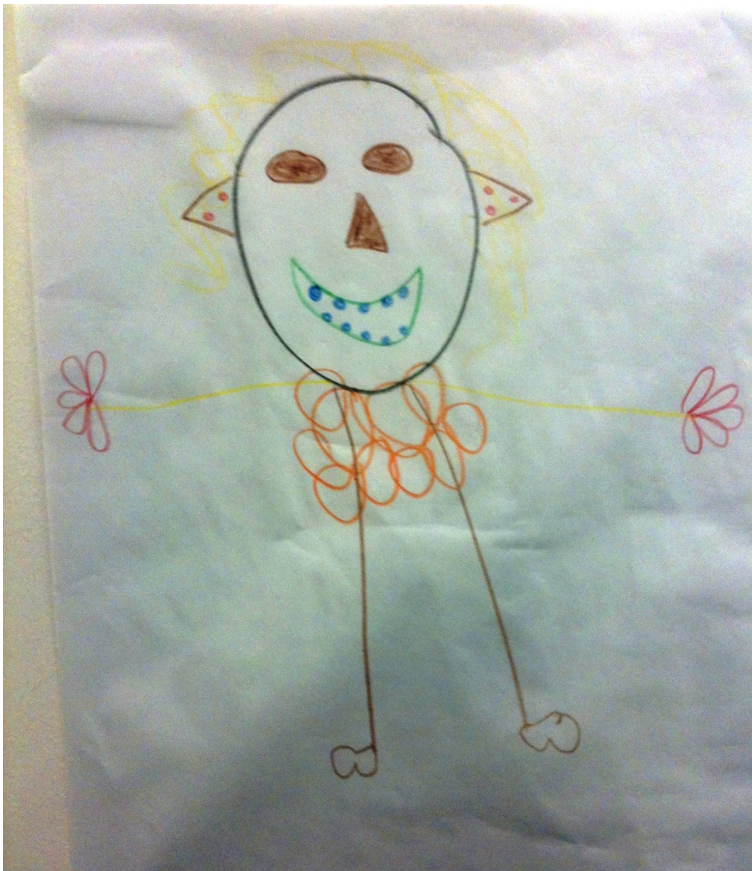
Aiken Drum with children's chosen food body parts

I wanted to share with you a large group I did that turned out to be one of the best large groups I have ever done without music. I have been looking for large group ideas. I came across Activity 16 in High/Scope's Large Group Activity Cards for Active Learners called Aiken Drum. I was not sure how the large group would go with this activity but thought I would give it a try. WOW, it was great. I followed the introduction from the card by telling the children I had been noticing their paintings of people at the art easel. We talked about the different body parts they like to paint and draw. I told them I had a song about a man who lived in the moon and he had food for his body parts. I drew the circle for his head and told them this was Aiken Drum and that he had spaghetti hair! I drew the spaghetti hair on my sheet for the children. I then asked, "I wonder what other body parts he has that are made of food?" The children were very interested and everyone came up with some body part made of food. He ended up having hamburger eyes, a beef nose, a bean mouth, blueberry teeth, pizza ears, french fry arms, ham fingers, ice cream body, chicken legs, and sandwich feet. This large group was a huge success and I am planning to continue by saying "Aiken Drum has a friend or a pet," having the children help create it again! Thanks for letting me share my success with you!