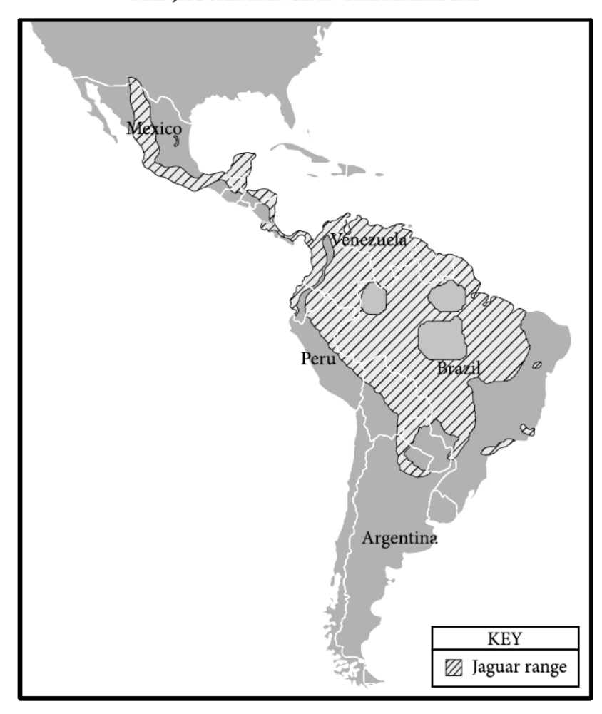
THE JAGUAR RANGE IN THE AMERICAS