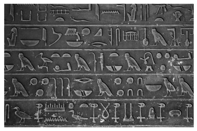
A photograph of an ancient Egyptian language.