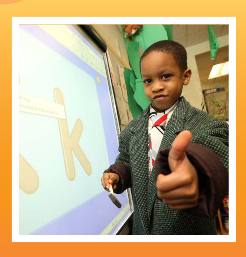
Pre-K Programs: South Zone