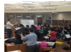
Edison hosted a Spring concert in the library.