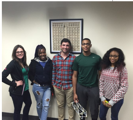
Edison sophomores took tours of many businesses and sites.