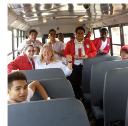
The SkillsUSA group returns to Edison in victory