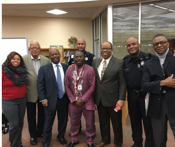
Edison's Pan African Summit brought together community leaders, students, and staff.