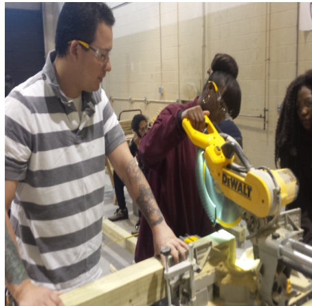
Edison's collaborative project with Habitat for Humanity

Hidden like the darkened shadowed corner Her place in this world has become erased Into the blackness she has let hold her A past, a destiny, cannot be traced She blames no one for what has come to be That maybe her leaving is for the best No one knows that she has gained her freedom And now her soul can finally rest Flying high in a sky no one can see Her spirit soars here and there Hovering like the moon over a tree Without a doubt, a thought, a single care No longer in chains that took and bound her No more tears and screams, only love surrounds her