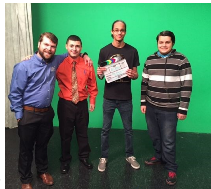
They were able to get some real world knowledge.

construction sites with construction managers, to testing bridges with architects and civil engineers. All school's partners made a special day for our students—including personalized discussions, interactive activities and lunches with company staff and leadership. Edison students are growing on their career journey—with more awareness and