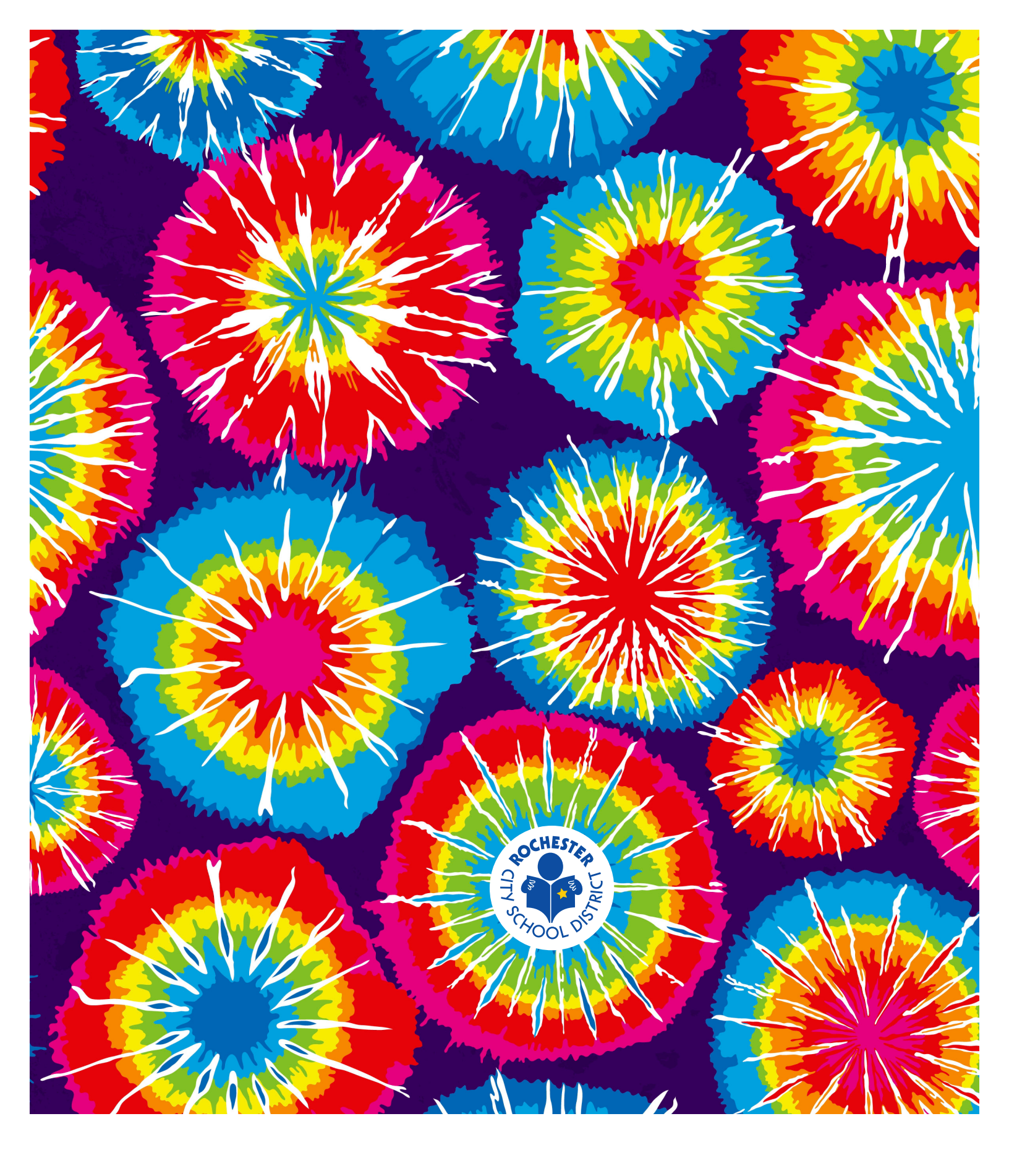
RCSD Summer Learning Programs 2016