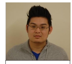
Courage Nou Wildcat Times Correspondent

April 22<sup>nd</sup> is Earth Day, a day when people give something back to the earth and their community.