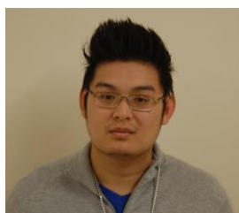
Courage Nou Wildcat Times Correspondent

Students tend to come to school tired because they do not get enough sleep for their brain to recover from the day. Work is not completed, students struggle to pay attention during their lesson, and many fall asleep in class.